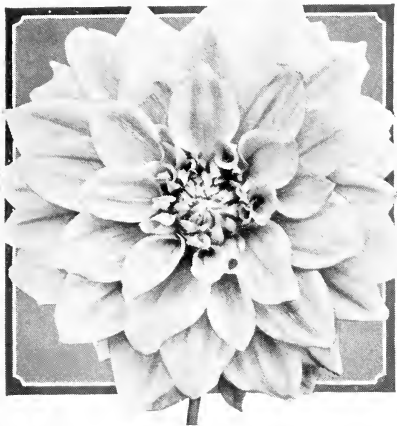
EL DORADO (Greatly Reduced)

EASTERN STAR F. D. (Dahlidel)—The color of this decorative is a saffron yellow with old gold shading. The flower is of good substance and good keeping qualities with full centers, held on strong, erect stems. Of excellent bush growth and free flowering. It gives 10 inches without forcing and has a wonderful prize winning record. $1.00 each, 3 for $2.70.